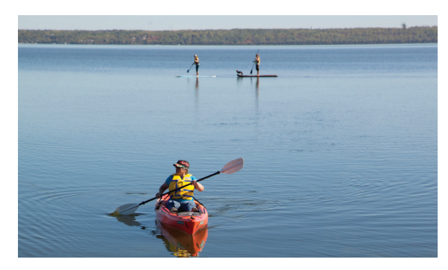
Kayaks and paddleboards

Rentals are available from Sir Winston Churchill Provincial Park Campground Store. All rentals come with safety equipment.