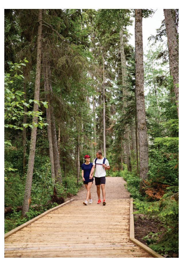
Hiking the accessible Miyo Mahkamikisi Trail on Big Island

Cover Photo: Long Island Updated November 2024