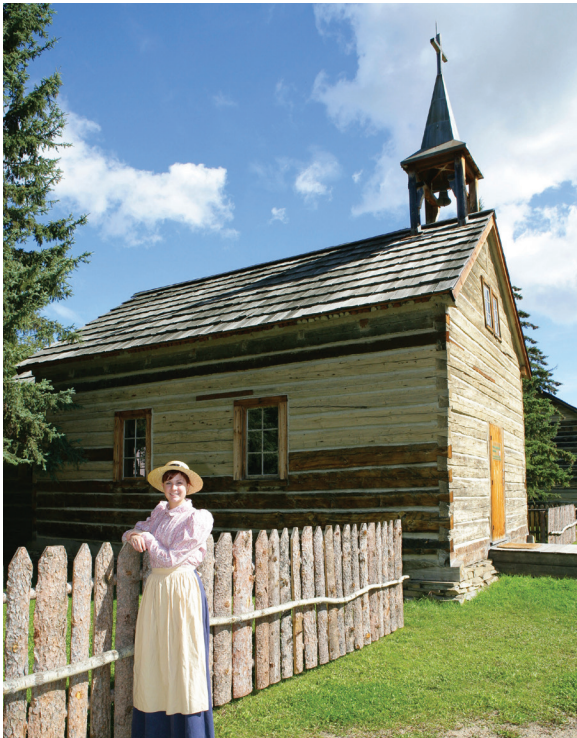
St. Charles Church and Rectory

Oblate missionaries began visiting the area in the 1840s, and in 1867 St. Charles Roman Catholic Mission was established here. The Anglican Church also built a mission, St. Savior’s, in 1879.