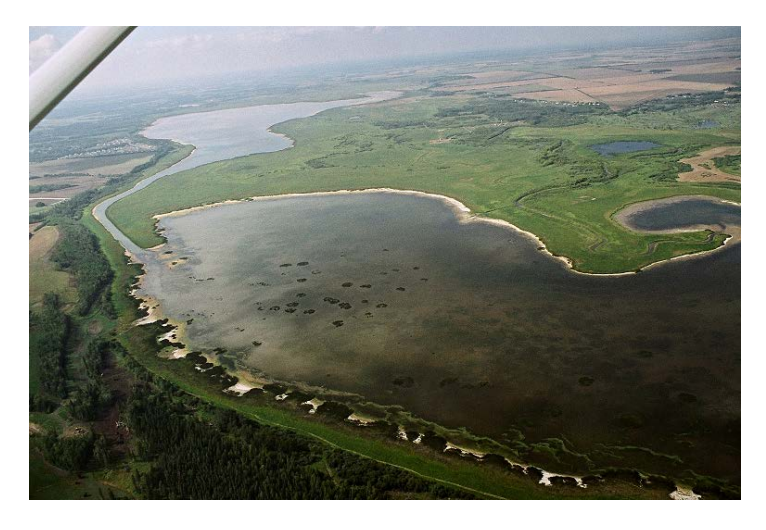
Big Lake Environment Support Society