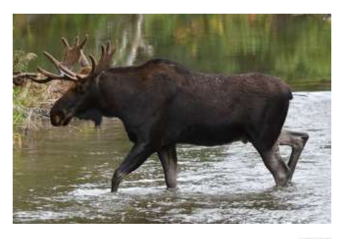
Big Lake Environment Support Society