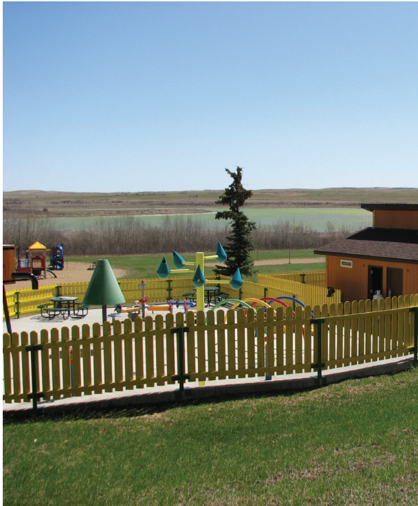
Water spray park

Cool off in the spray park operated by Special Areas or visit on Father's day weekend and watch one of the largest rodeos in the area.