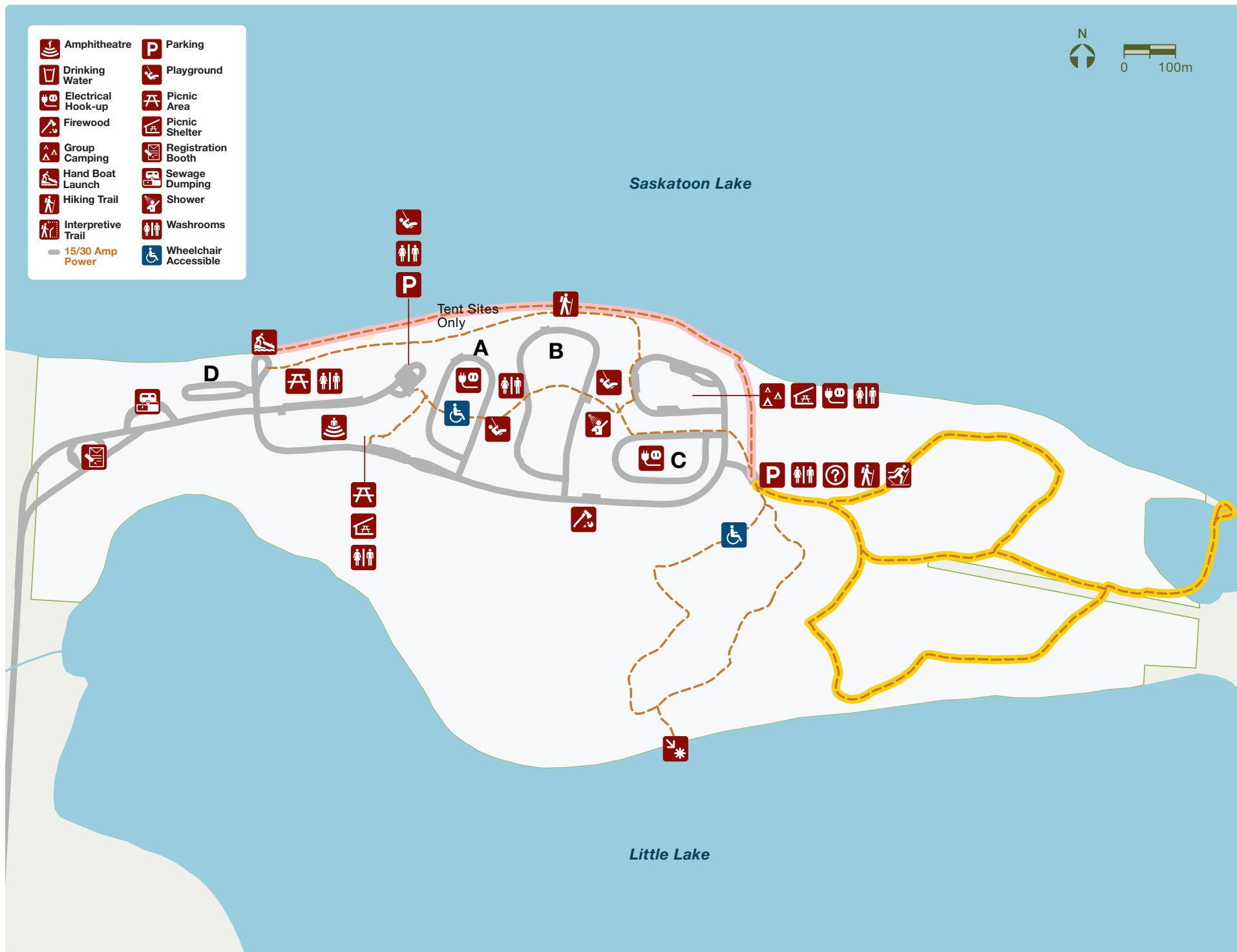
Saskatoon Island winter trails map