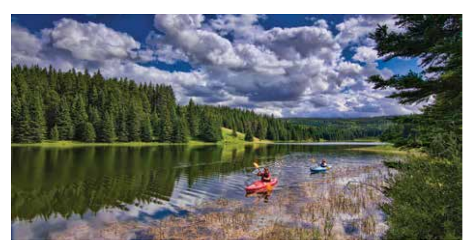
Cypress Hills Provincial Park