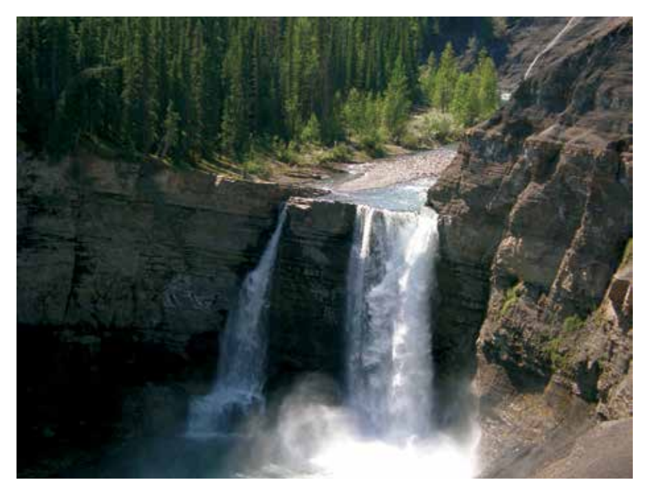
Ram Falls Provincial Park

41 km southwest of Rocky Mountain House on Hwy. 752.