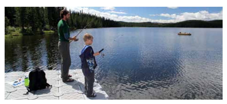
Fish Lake Provincial Recreation Area