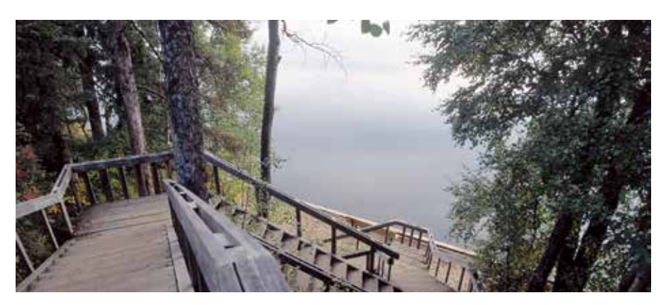
Carson-Pegasus Provincial Park