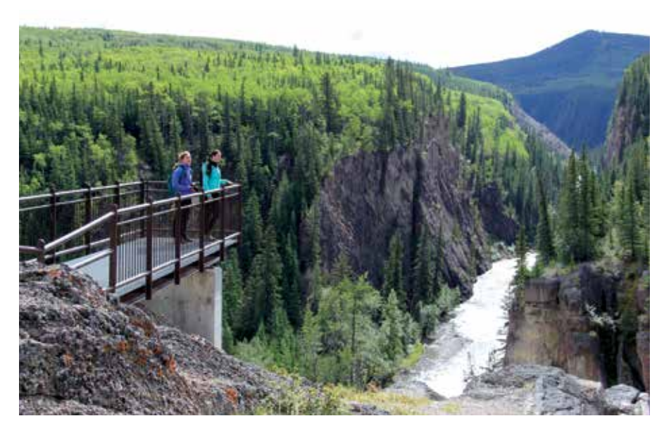
Sulphur Gates Provincial Recreation Area