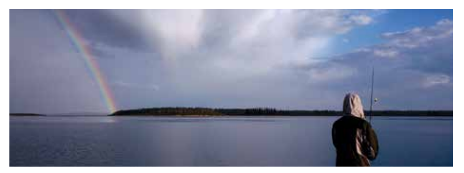
Sir Winston Churchill Provincial Park