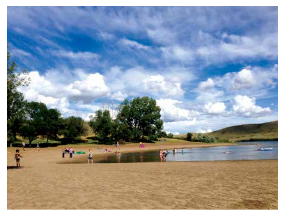
Little Bow Provincial Park