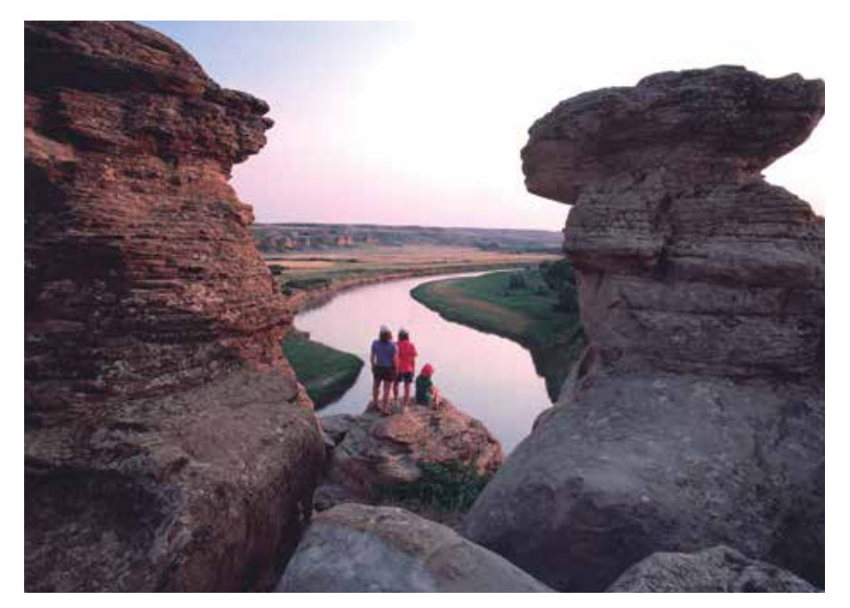
Writing-on-Stone Provincial Park

Vermilion ♠ ♥ Summer: 780-853-4372, Winter: 1-877-537-2757 Northern edge of town of Vermilion off Hwy. 41.