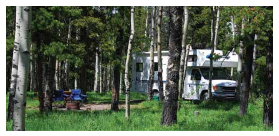
Indian Graves Provincial Recreation Area