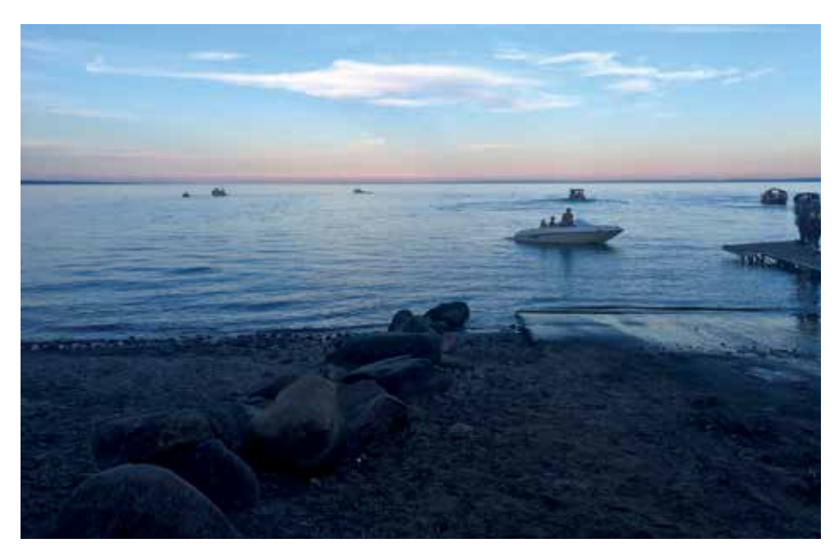
Hilliard's Bay Provincial Park