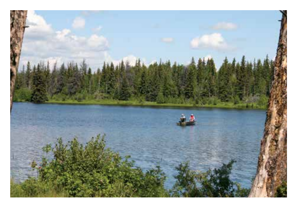
Ole's Lake Provincial Recreation Area