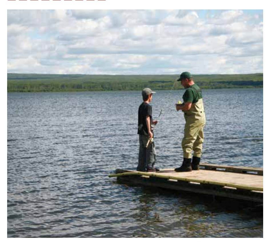
Young's Point Provincial Park