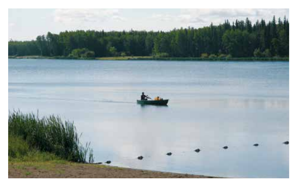
Moonshine Lake Provincial Park