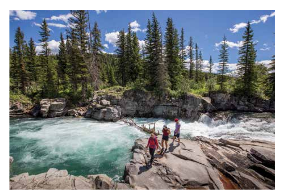
Castle Provincial Park