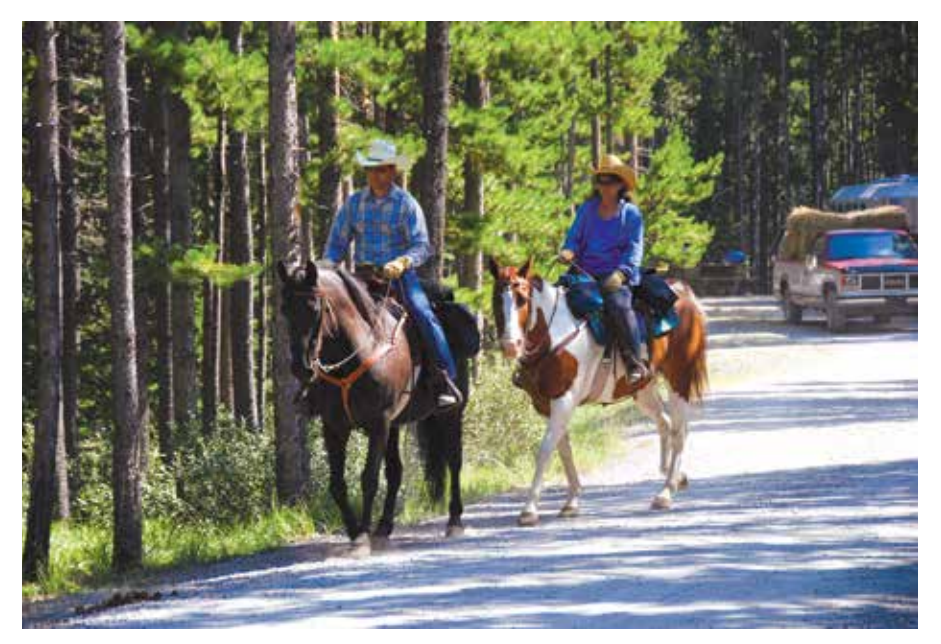
Little Elbow Provincial Recreation Area