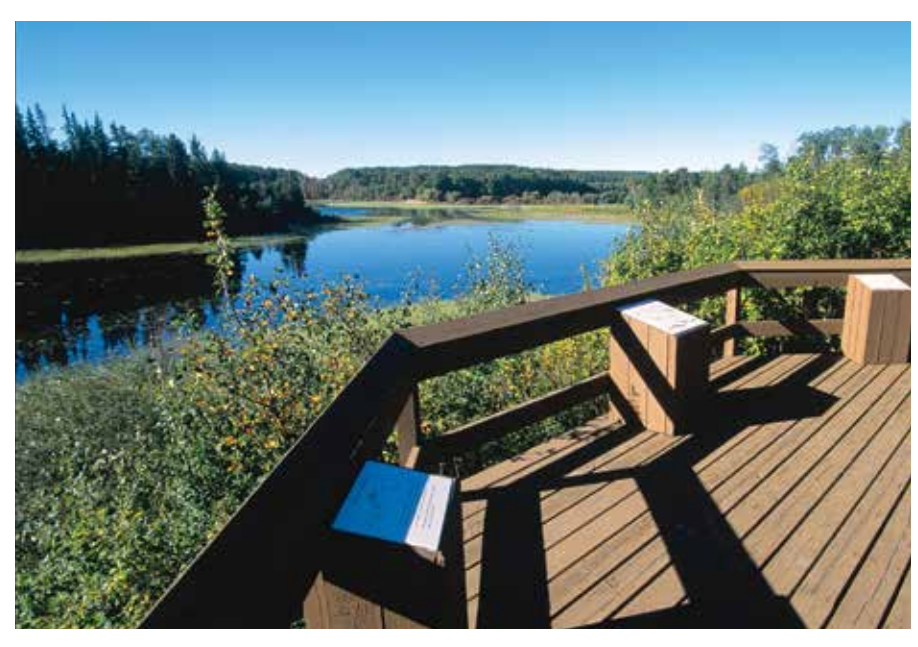
Cold Lake Provincial Park