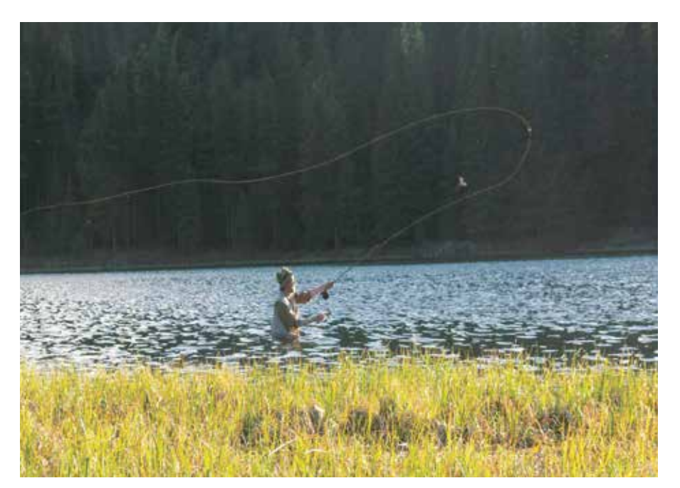
Two Lakes Provincial Park