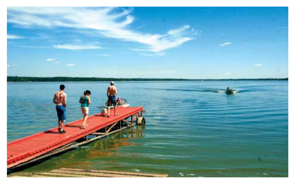
Franchere Bay Provincial Recreation Area