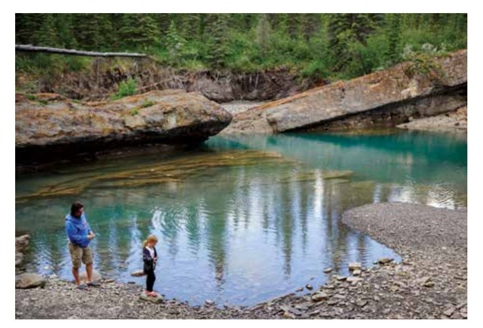
Bow Valley Provincial Park