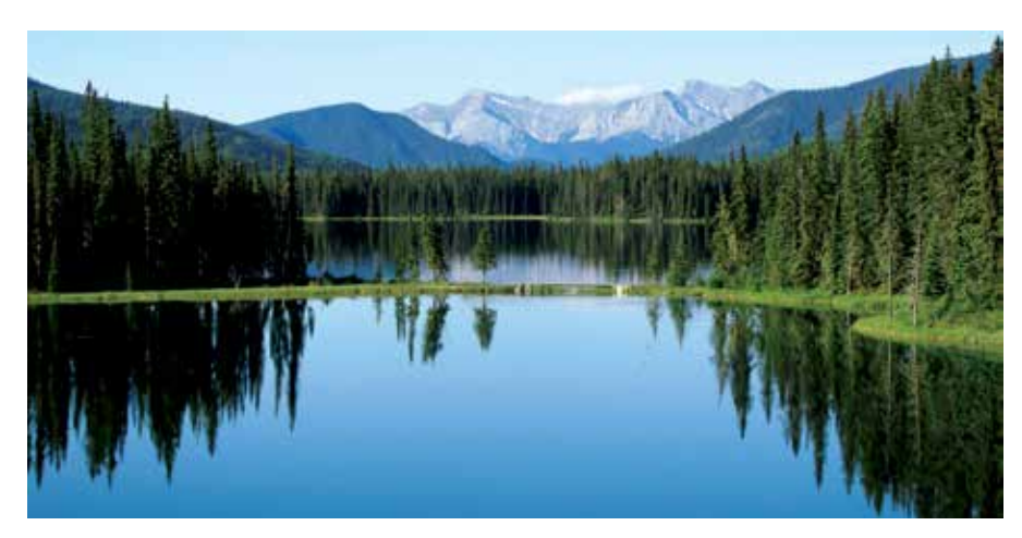
William A. Switzer Provincial Park