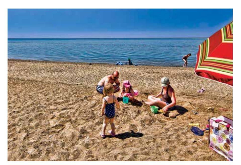
Kinbrook Island Provincial Park