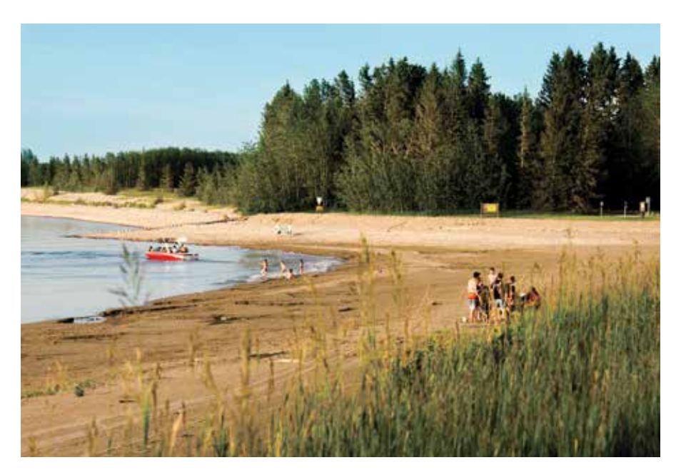
Glennifer Reservoir Provincial Recreation Area