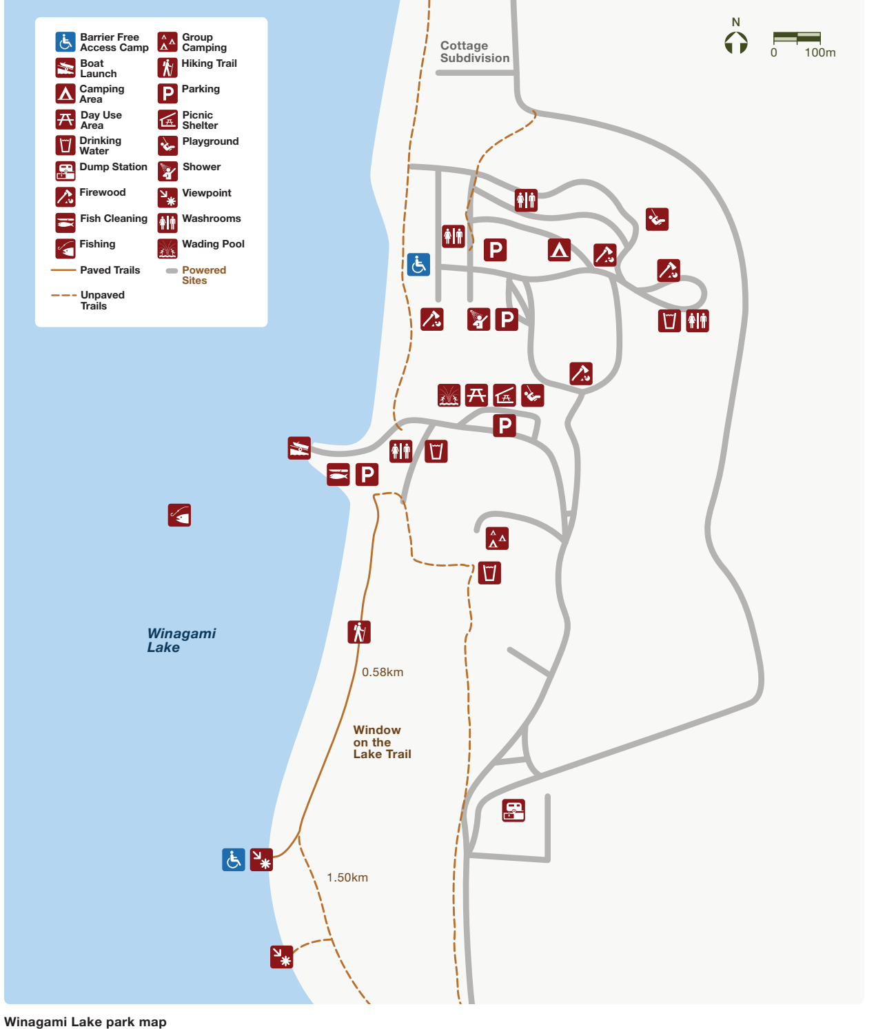
Winagami Lake park