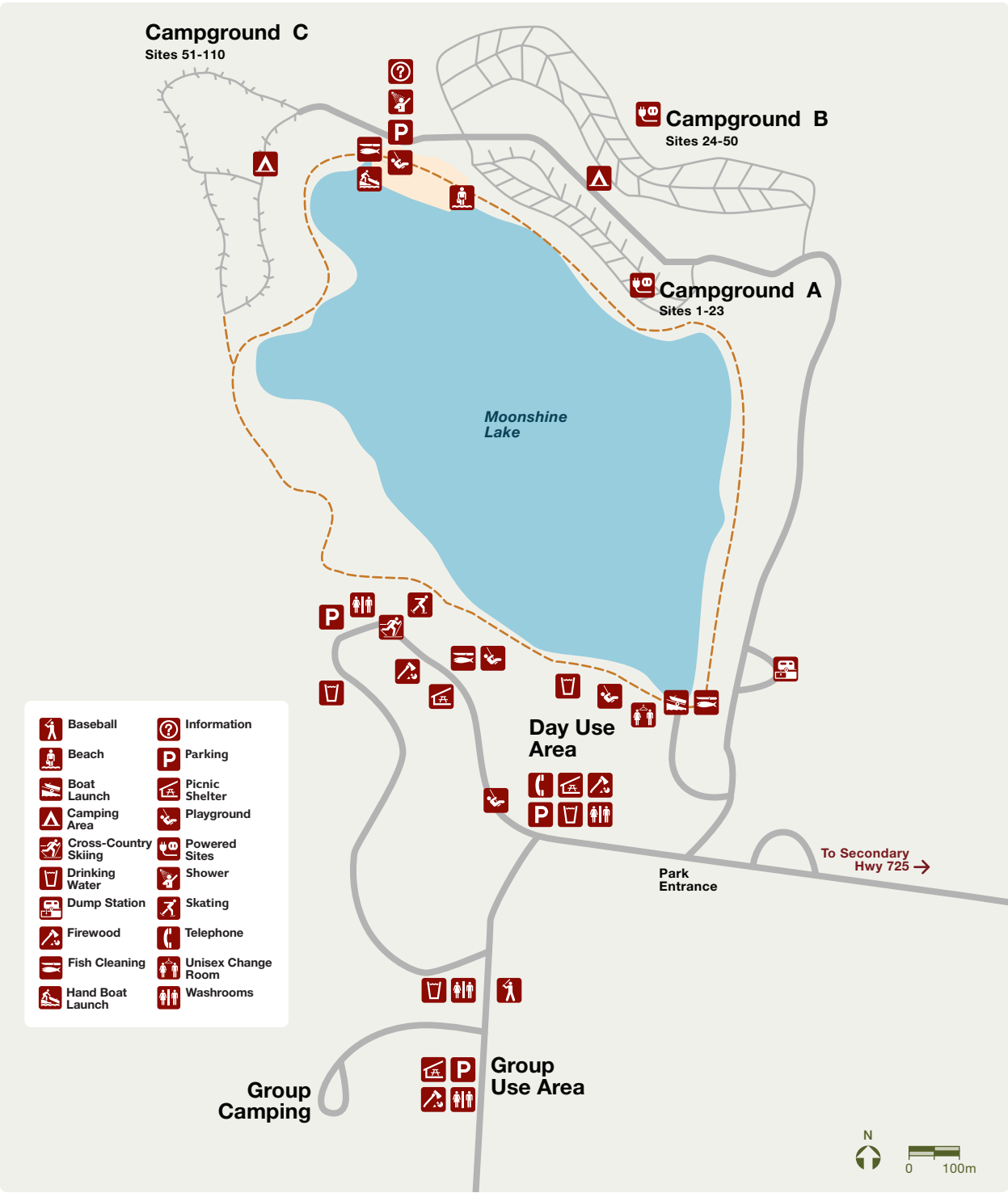
Moonshine Lake park map