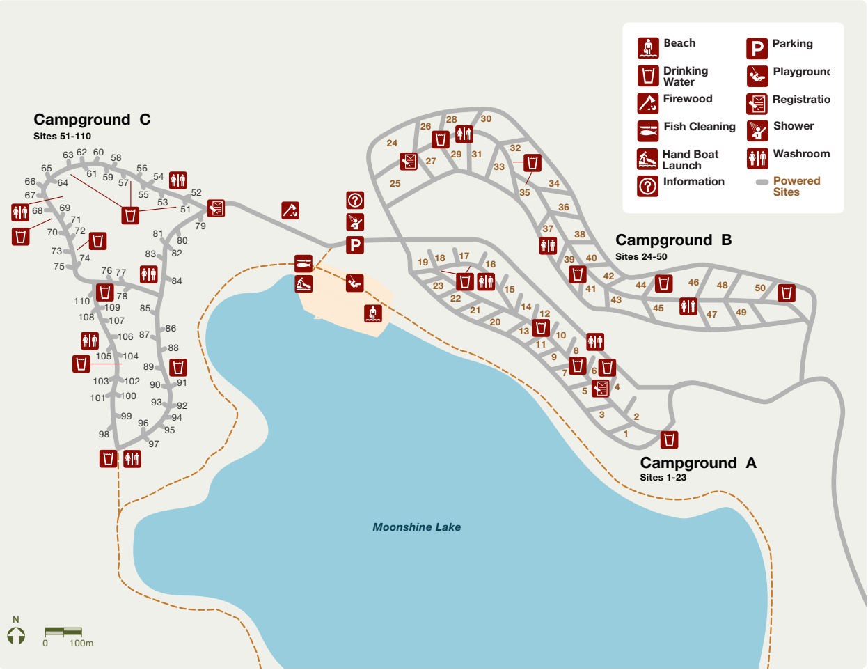
Moonshine Lake campground map

Moonshine Lake Provincial Park was established in 1959 and covers an area of 1103 hectares. The Lake, formally known as Mirage, had a name change after two local men accidentally spilled their home-brewed moonshine into the water while transporting it around the lake.