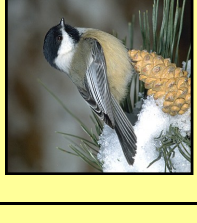
CRUNCH YOUR FEET IN THE SNOW