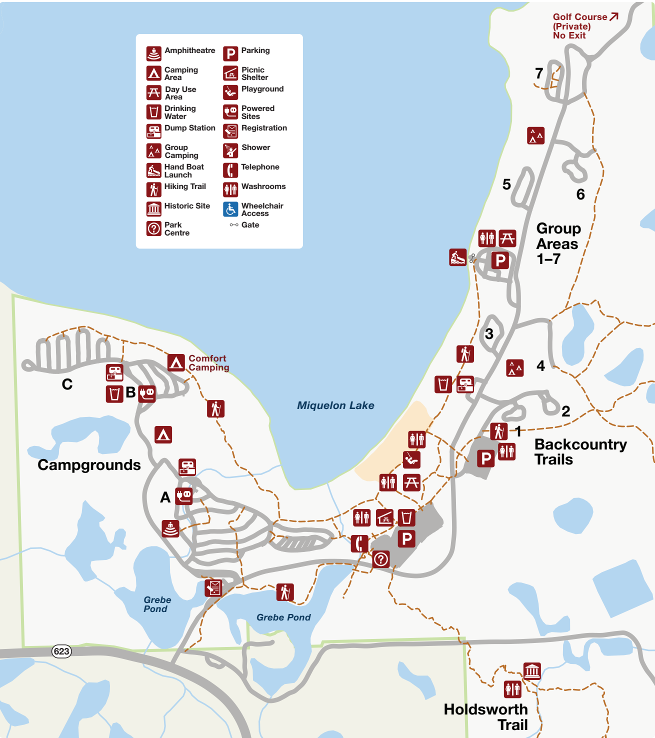
Miquelon Lake backcountry trails map