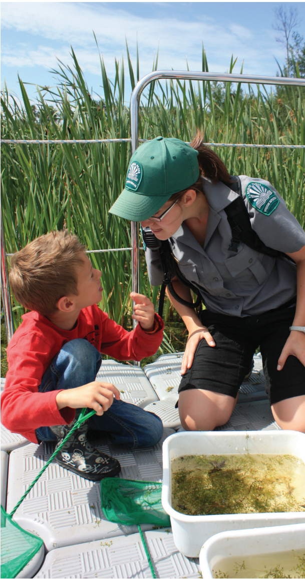
Discover Miquelon Lake at our interpretive programs

Explore aquatic and winged life around Grebe Pond, try matching tracks to animals, paint a beautiful watercolour landscape or search for constellations in the sky. The park's discovery packs contain everything your family will need to start your own discoveries of life in the park. Packs are available from the Park Centre during the summer season.