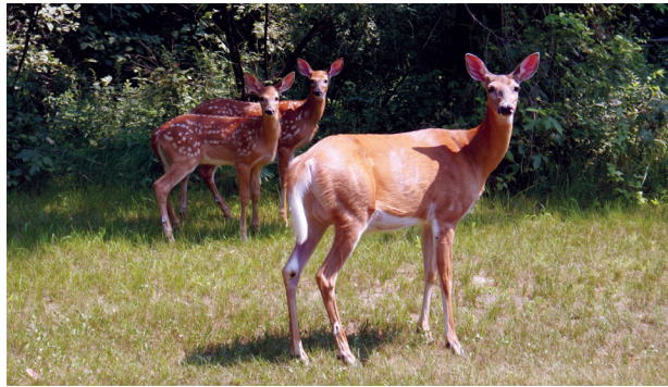
White-tailed deer fawns

Miquelon Lake Provincial Park is recognized for many of its noteworthy features. It is internationally recognized as an Important Bird Area for its value to nesting ring-billed and California gulls and is part of the Beaver Hills UNESCO Biosphere because of the rich diversity of life it sustains. It is also part of the Beaver Hills Dark Sky Preserve and is the perfect place to stargaze into the night sky.