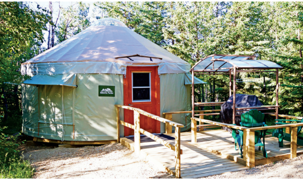
Comfort camping yurt

Stay in comfort at one of our fully furnished yurts. Cooking utensils, refrigerator, BBQ and queen-sized beds are just a few of the luxuries we provide for you. Reservations can be made at reserve.albertaparks.ca or 1-877-537-2757.