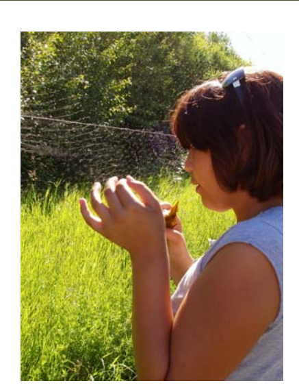
Student extracting a fake bird from mist net