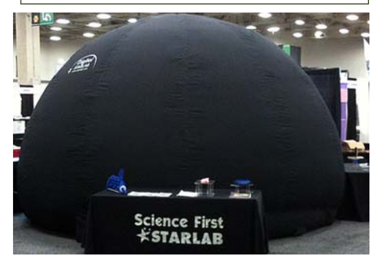
Inflatable starlab dome