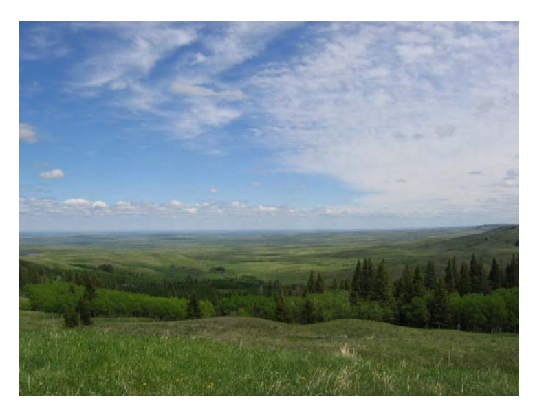
Landscape just waiting to be painted