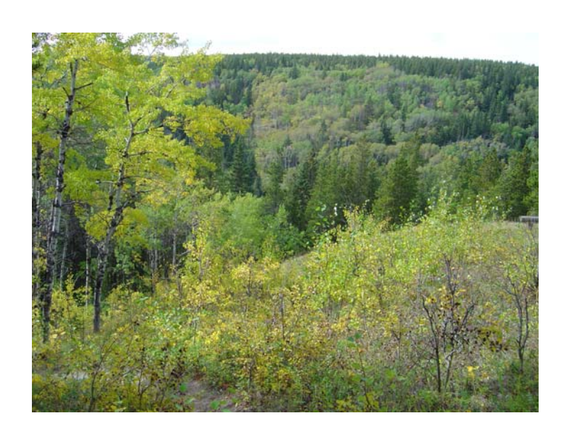
Mixed forest in the Cypress Hills