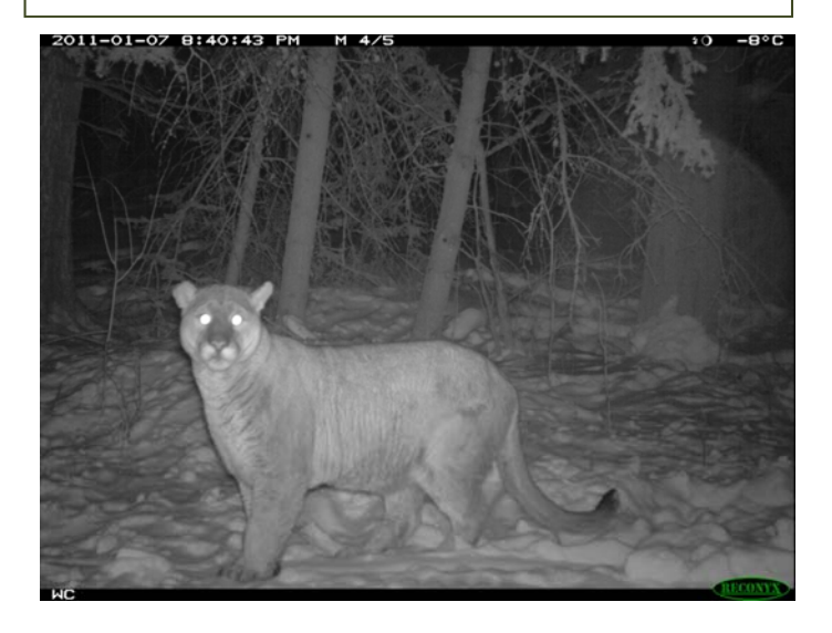
A cougar in the Cypress Hills.