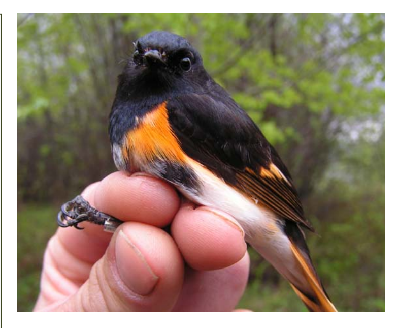
An American Redstart is held before release