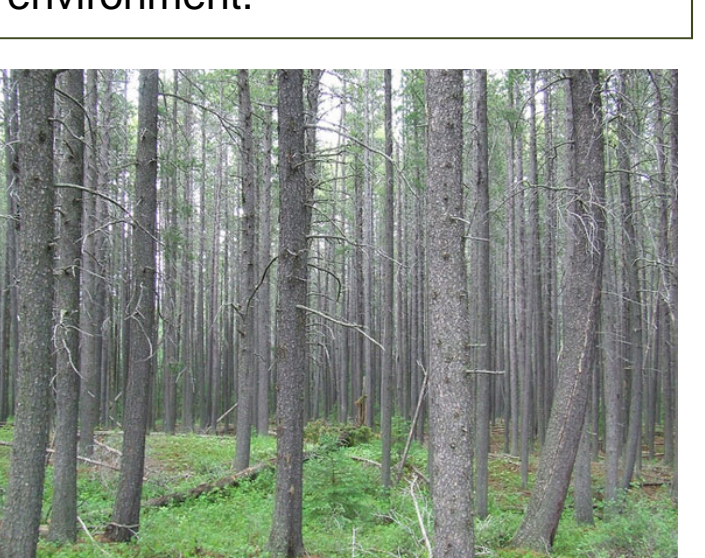
Lodgepole pine forest