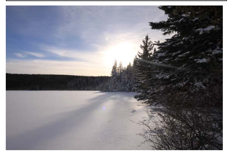
Spruce Coulee after a fresh snowfall