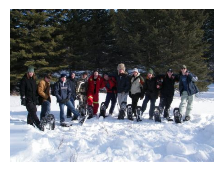
Class enjoying the fresh snow at Cypress Hills