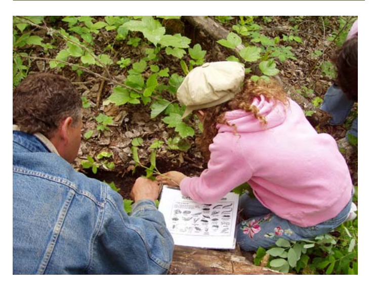
Identifying species of plants