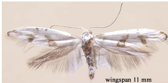
wingspan 11 mm Argyresthia oreasella 15-VII-2001, Buffalo Lake, AB, C.D. Bird