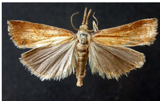
Neodactria luteocellus , wingspan 23 mm: ALBERTA, Buffalo Lake Conservation Area, 23-VI-2002, C.D. Bird, BIRD 501, C.D. Bird image