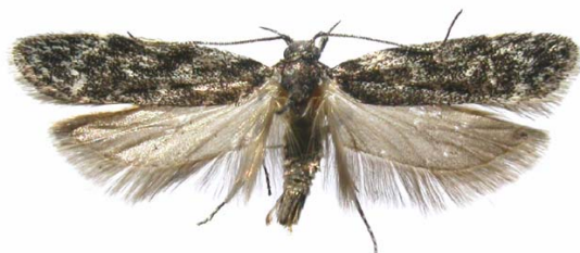
Gelechia lynceola , wingspan 15 mm; ALBERTA, Buffalo Lake, 22-VI-2001, C.D. Bird, BIRD5, C.D. Bird image