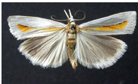
Crambus girardellus , wingspan 28 mm: ALBERTA, Buffalo Lake Conservation Area, C.D. Bird, BIRD147