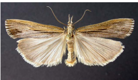
Pediasia trisecta , wingspan 32 mm: ALBERTA, Buffalo Lake Conservation Area, 9B-IX-2002, C.D. Bird, BIRD85, C.D. Bird image