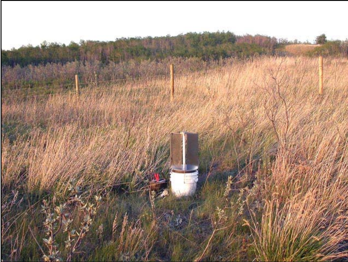
A moth trap in prairie grassland with silver willow nearby and aspen in the background; Buffalo Lake Conservation Area, 4 Jun 2004.

There is still much to be learned about the distribution and status of lepidopteran (moth and butterfly) species in south-central Alberta. Baseline studies of this sort provide information that helps characterize the species associated with various ecoregions, in the present case Aspen Parkland; determine the status designations (abundant, common, rare, endangered) of various species; show the effects of grazing on species composition and abundance; and allow the examination of many other parameters, including phenology, dry vs. wet years, and outbreaks of various species such as forest tent caterpillar.