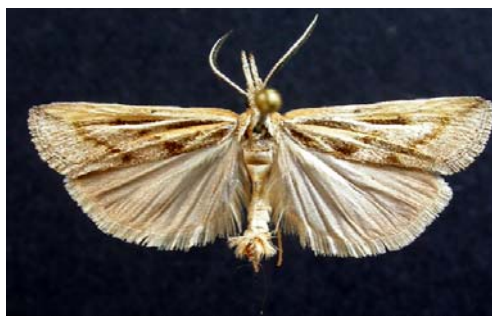
Thaumtopsia pexella coloradella , wingspan 25 mm: ALBERTA, Buffalo Lake Conservation Area, 30-VIII-2001, C.D. Bird, BIRD716, C.D. Bird image