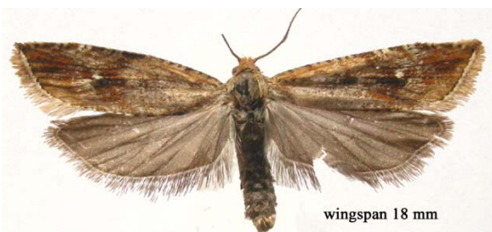
wingspan 18 mm Bactra furfurana 17-IX-2001, Buffalo Lake, AB, C.D. Bird