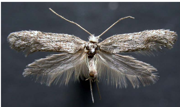
Acanthopteroctetes bimaculata , wingspan 11 mm; ALBERTA, Buffalo Lake, 20-V-2005, leg. C.D. Bird, BIRD9534