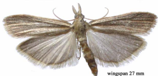
wingspan 27 mm Anerastia lotella 4-VIII-2001, Buffalo Lake, AB, C.D. Bird