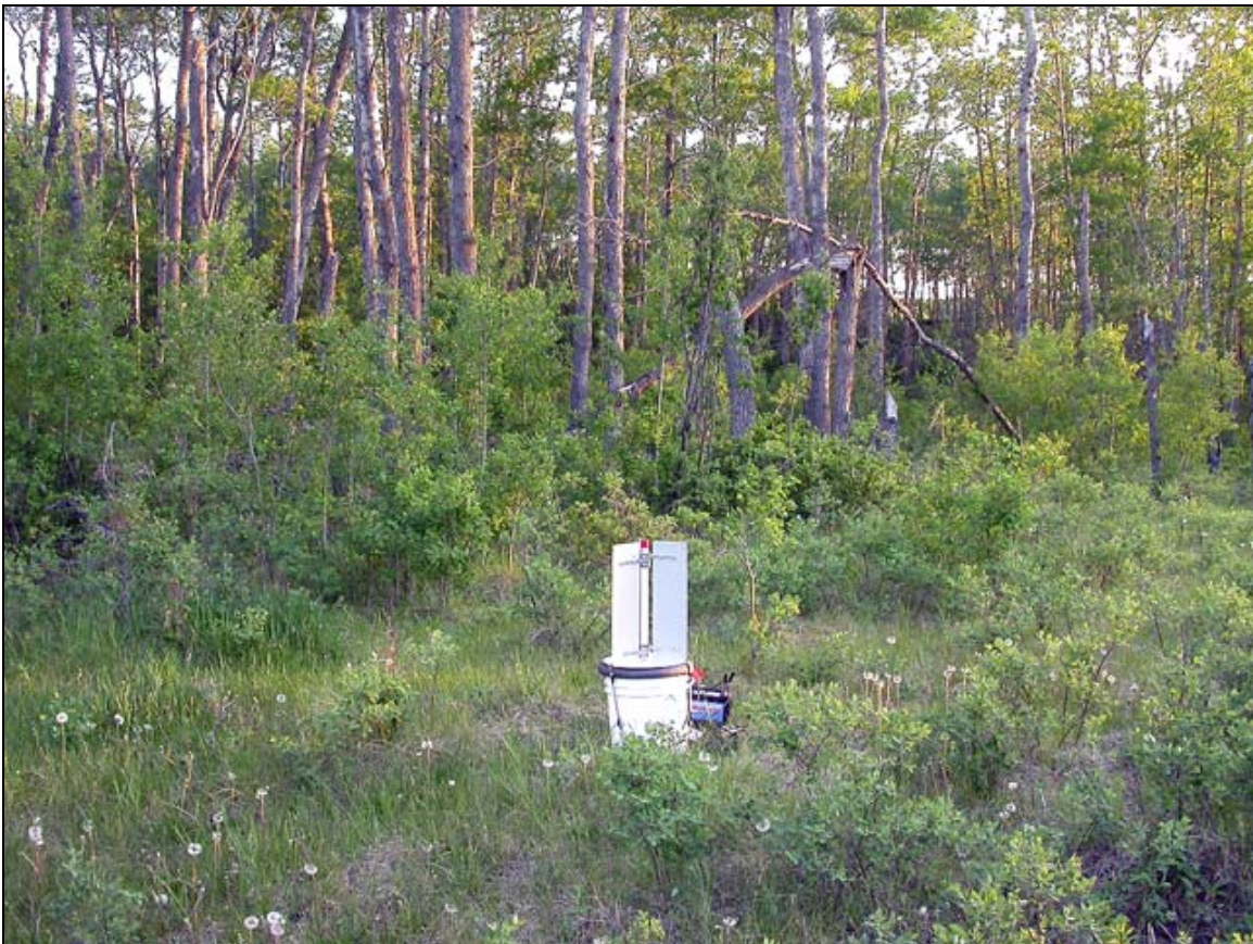
A UV moth trap set up in an aspen stand on June 4, 2004 in the Buffalo Lake study area.