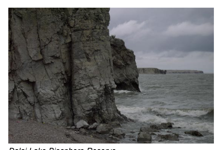
Dalai Lake Biosphere Reserve

The Hay-Zama Lakes area has long been recognized by Aboriginal Peoples for its natural values, and conservation groups have worked to protect the area's waterfowl habitat since the 1930s. In 1982, Hay-Zama Lakes was designated a "wetland of international significance" under the Ramsar Convention on Wetlands. The Ramsar Convention promotes wise use of wetlands at 1675 Ramsar sites throughout the world. Hay-Zama was designated a wildland park in 1999.