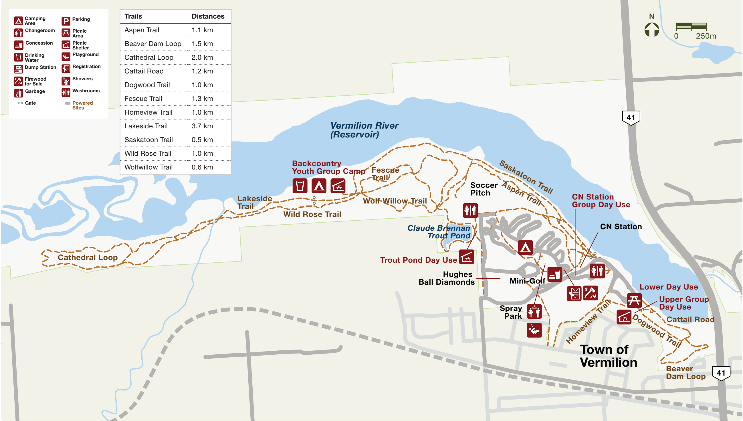
Vermilion trail map